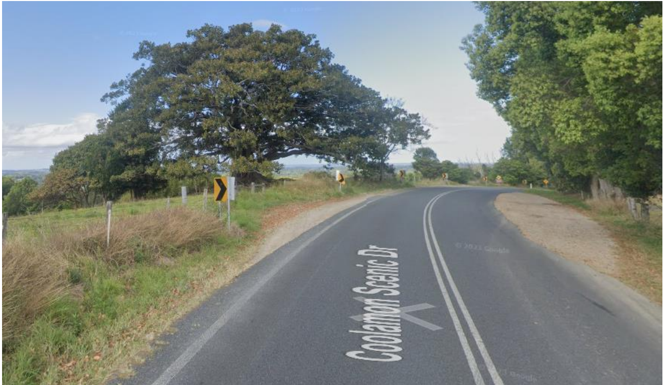
Figure 2: Current un-formalised slow vehicle pullover (street view)

Council staff are reluctant to formalise this form of passing arrangement due to the presence of roadside hazards within the nominal clear zone (large trees, steep batters etc), sight distance constraints and lack of acceleration for heavy vehicles re-entering traffic. Consequently, Council staff would only consider this type of arrangement should a design meet similar requirements to the passing room required for Rural Basic Right-turn Treatment (BAR) treatment, or preferably road widening allowing the additional of a compliant short overtaking lane.