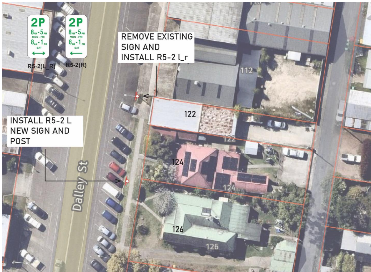
Figure 1: Signage Plan