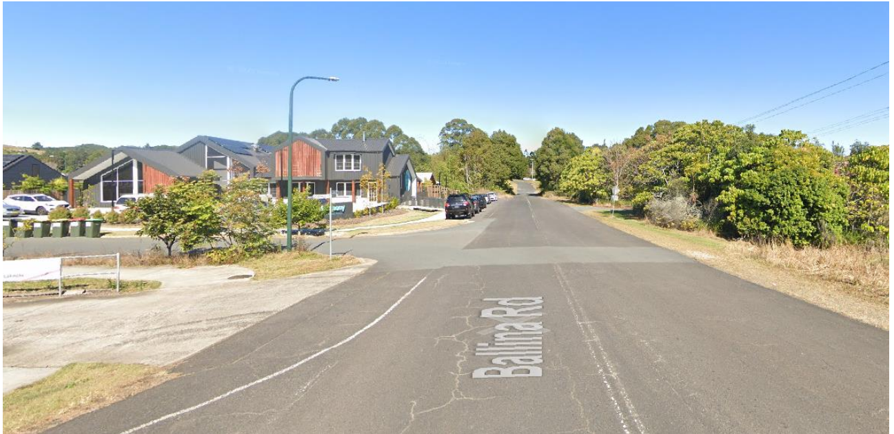
Figure 3: Sketch of proposed Give Way line marking and signage