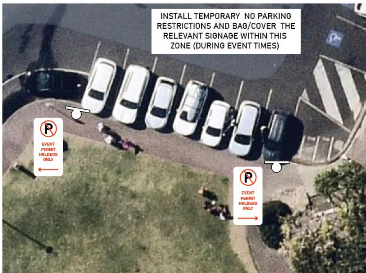
Figure 2: Temporary restrictions for events

Dates: 24 th November until 2 nd December 2023