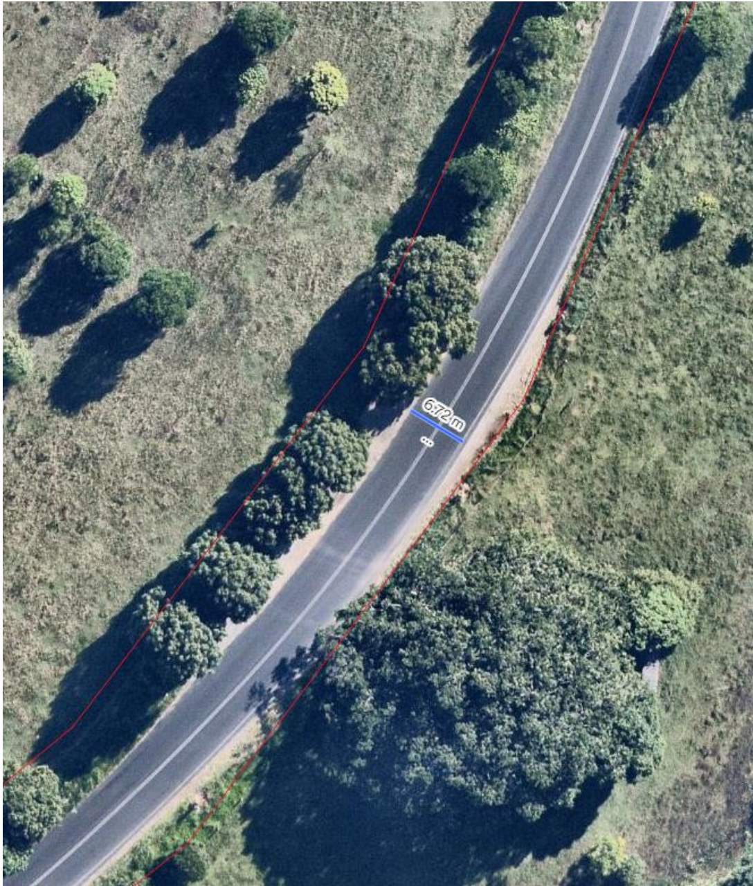
Figure 1: Current un-formalised slow vehicle pullover