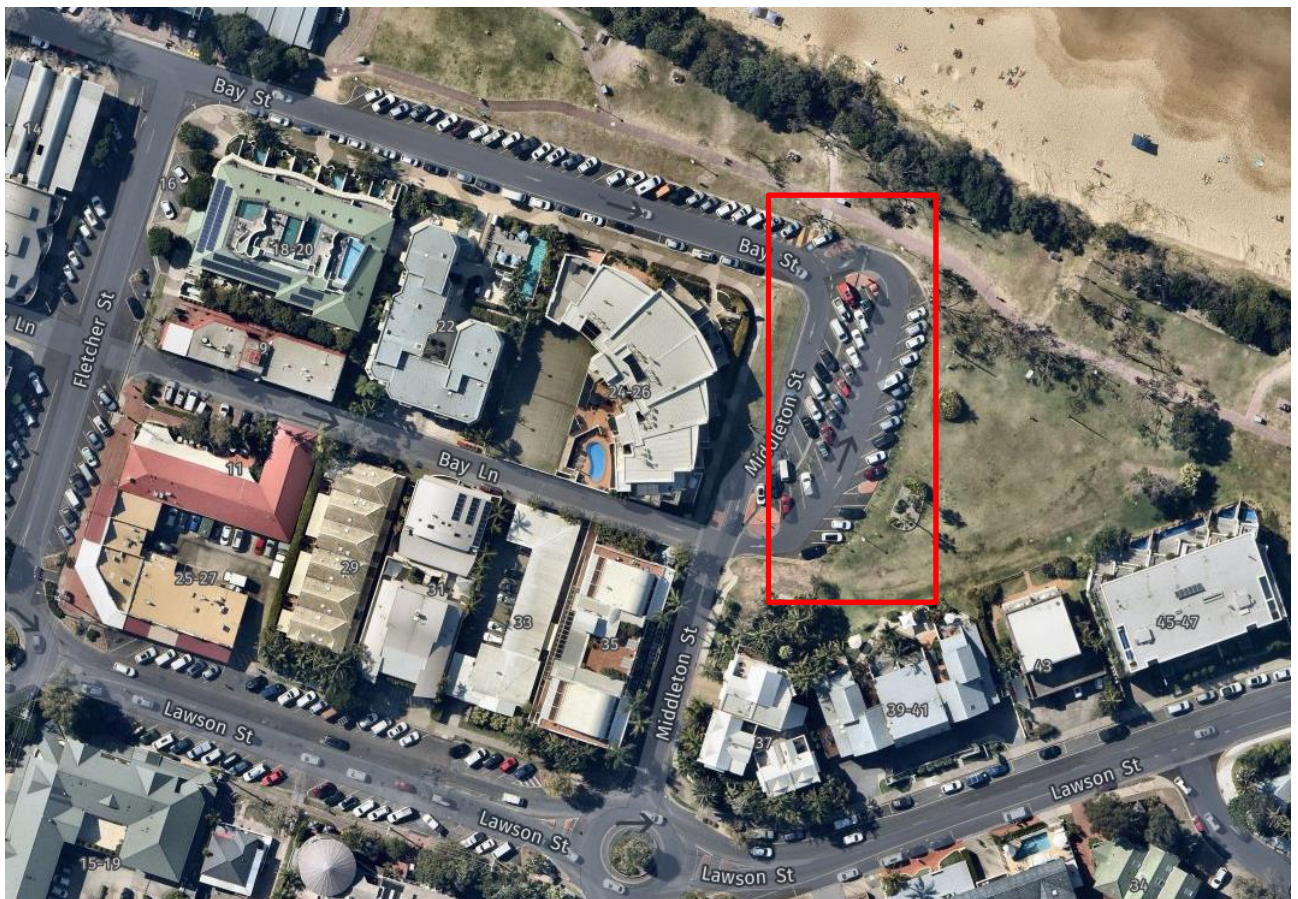
Figure 1: Above carpark locality map

An example of an instruction order to activate these proposed restrictions is shown in attachment 1.